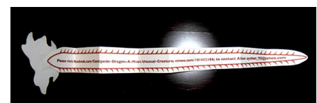
15. Here is Centipede Dragon's underbelly!