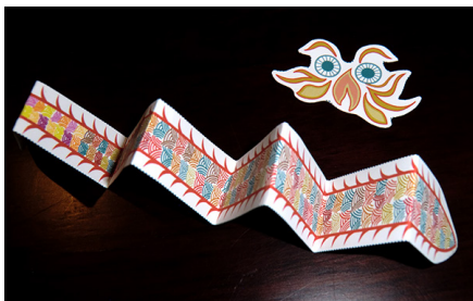
10. Head and tail sections should face down when scale-side is up.