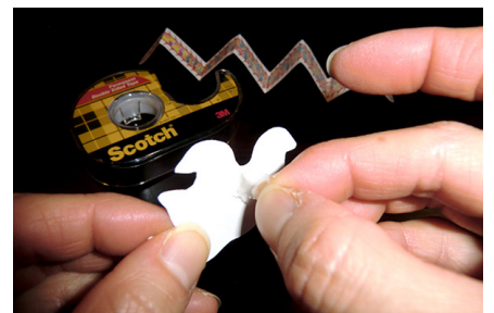
12. Place a small piece of tape to upper edge of back side of head, in between eyebrows.