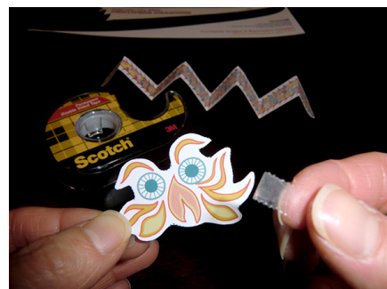
11. Use double-sided tape to attach the head.