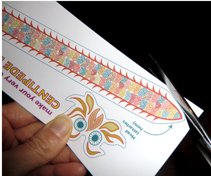
1. Cut out body.

Step-by-step instructions for the Centipede Dragon accordion bookmark.