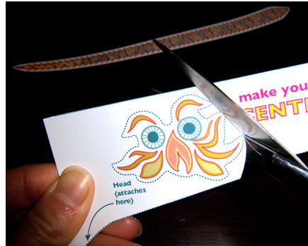
2. Cut out head.