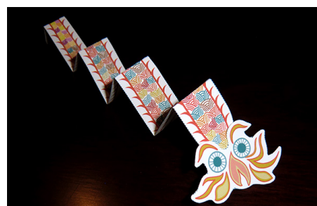
14. Here is your finished Centipede Dragon!