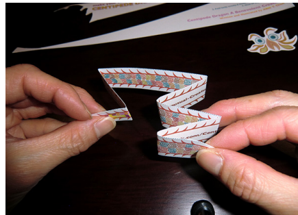
8. Fold remaining sections in between 1st and 2nd fold, and 1st and 3rd folds.