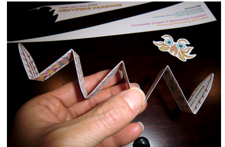
9. Folds should be alternating in direction to form an accordion.