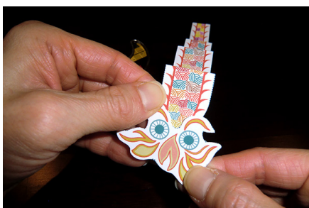
13. Attach head to wider end of body.