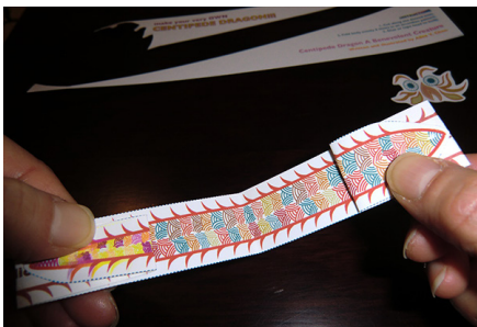
7. Take other end and fold back to 3rd fold made in step 5.