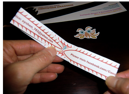
5. Make 3rd fold by folding other end toward 1st fold.