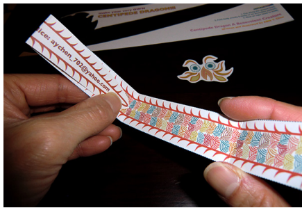
4. Open back up. Make 2nd fold by folding one end toward 1st fold.